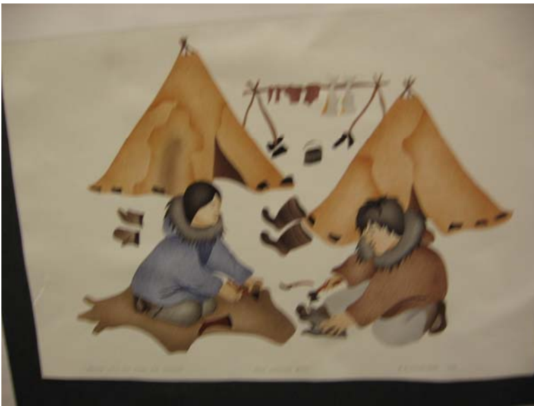
Inuit sewing clothing.

Only fur clothing was warm enough in a cold place like Nunavut. Inuit like to use caribou but sometimes used other animal fur like seals and polar bears.