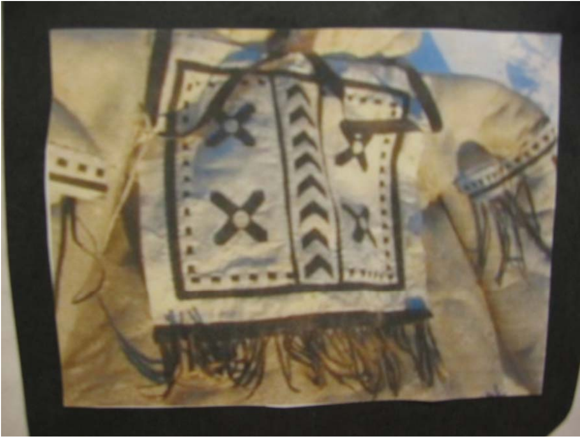
Ladies Amauti decorated.