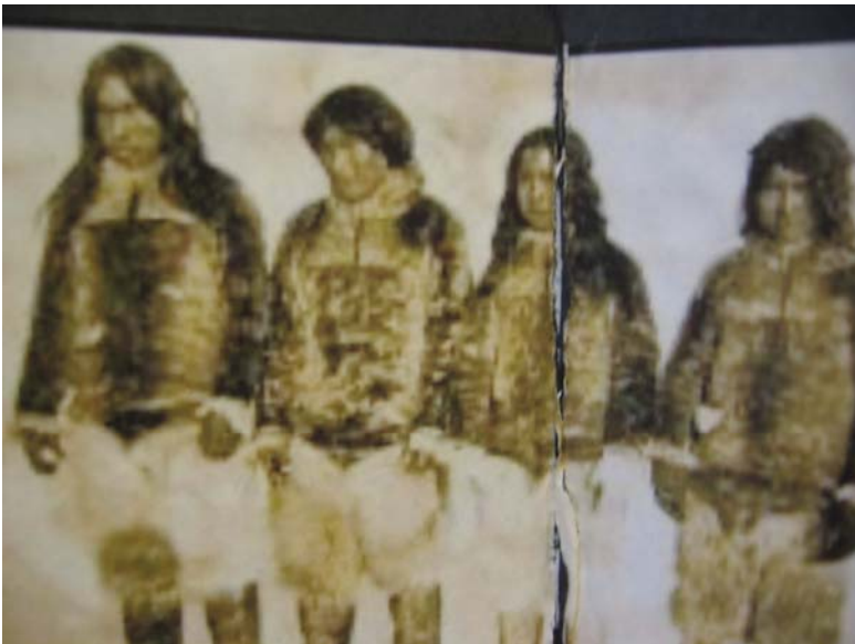
Inuit men wearing seal and polar bear fur clothing.

The arrival of Europeans in the North made cultural changes to the Inuit clothing. Inuit got glass beads; fabric, metal and they added new decorations to the clothing.