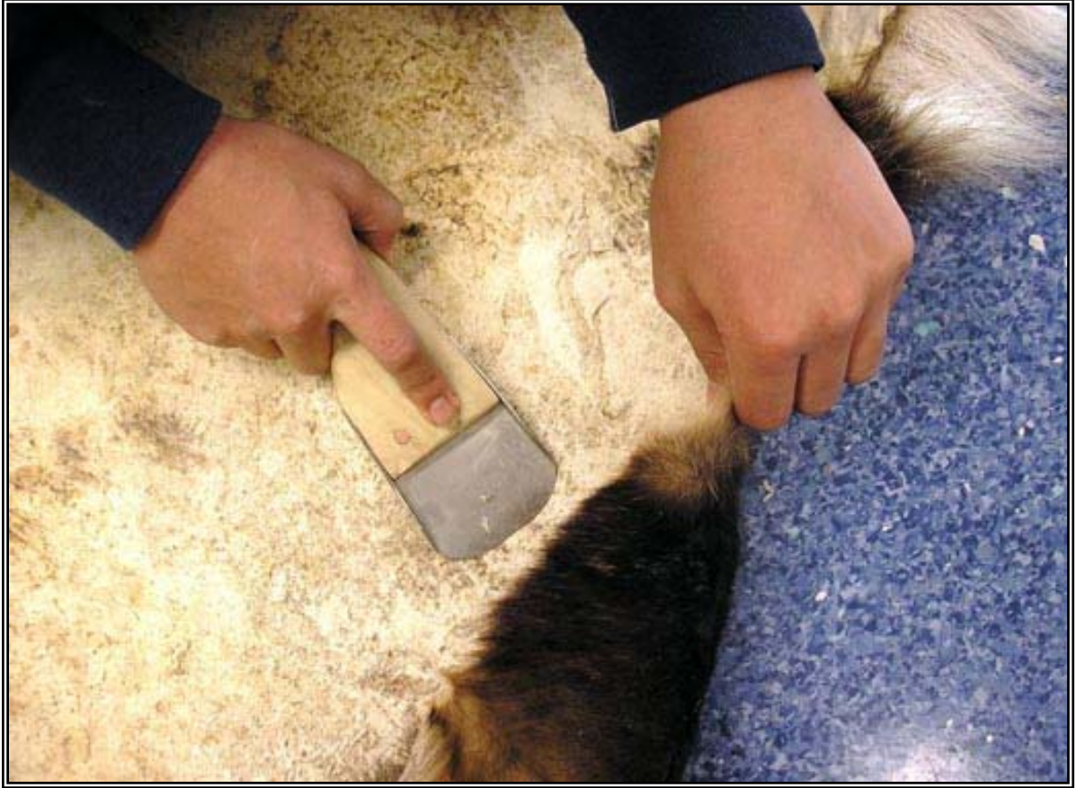
አጠጋቢ ለገሰ ማሳጠጥ