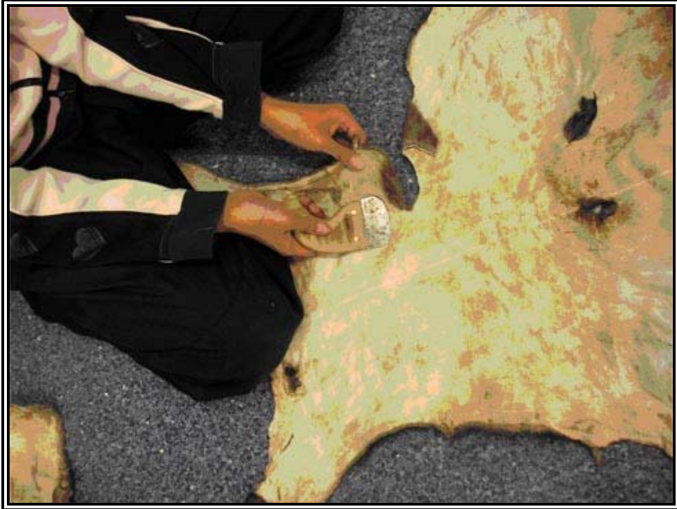
ᐅ. ᐃᒃᐱᐅᐅᐅᐅᐅᐅᐅᐅ ᐃᓃᓃᐅᐅ