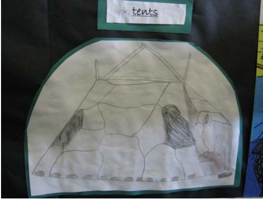
Drawn by Craig Nanordluk Painted by Jermaine Ivalutanar